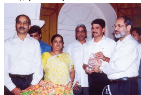
Utilisation of Biogas for Power Generation and Reuse of Treated Sewage, Chennai Metropolitan Water Supply and Sewerage Board.