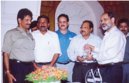
Reforms in Revenue Enhancement, Kerala Water Authority.