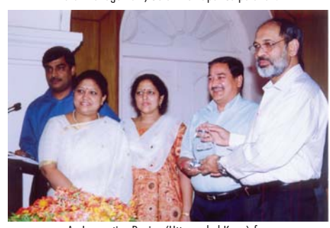
An Innovative Device (Uttaranchal Koop) for Tapping Potable Drinking Water, Uttaranchal Jal Sansthan.