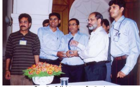
Operation & Maintenance Practices in Water Management, Surat Municipal Corporation.

Tangible improvements in service delivery