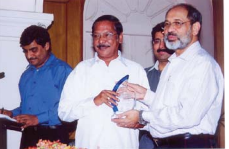
Public-Private Community Participation in Implementation of Underground Drainage System, Alandur Municipality.